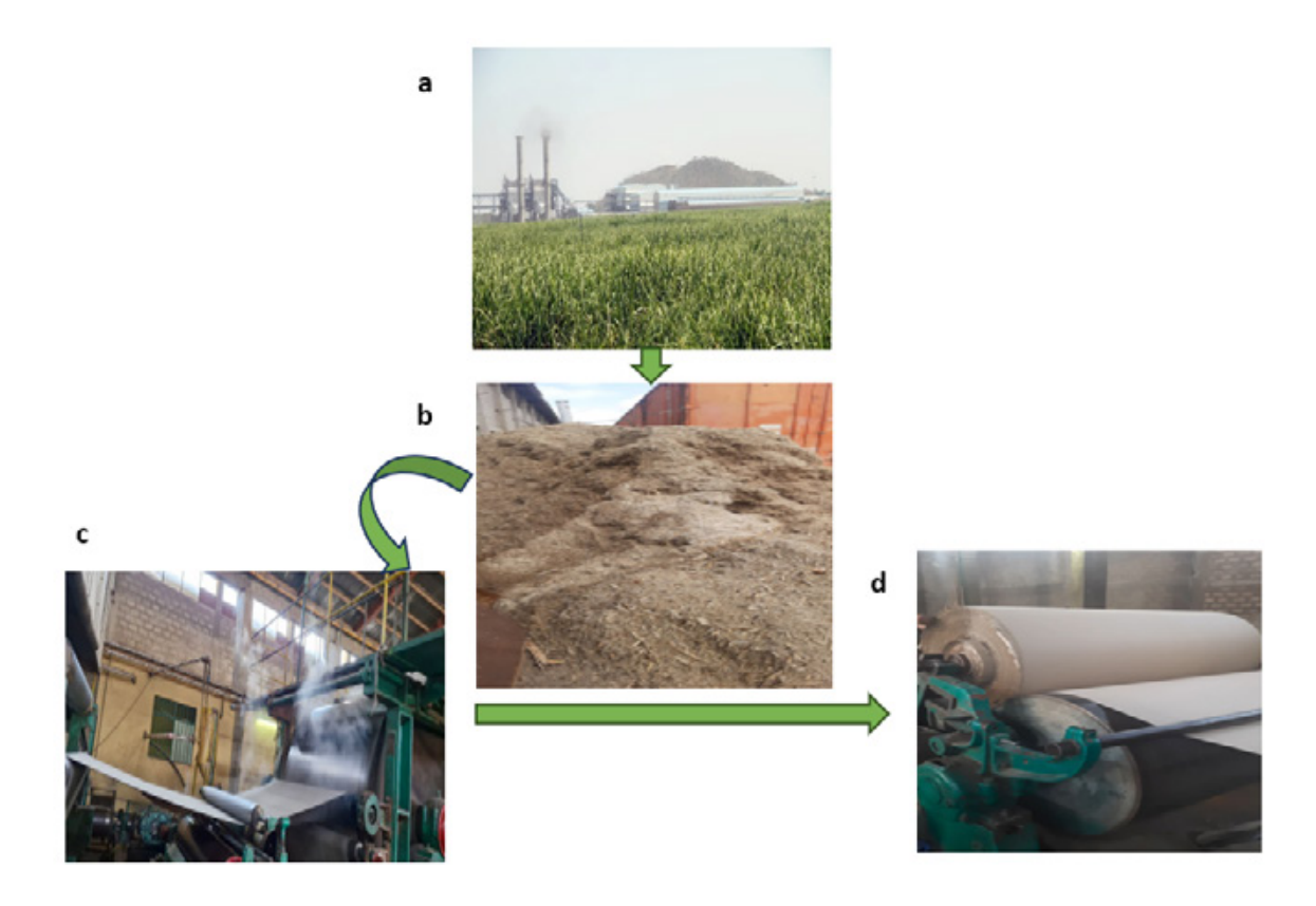
Illustration of conversion of bagasse into paper. (a) Wongi Shoa sugar factory (https:// etsugar.com/esig/2023/01/27/wonji-shoa-sugar-factory/, accessed on April 19, 2024) b) Bagasse accumulated in Wongi Shoa sugar factory; (c and d) paper made from virgin pulp out of bagasse at Barguba PLC, Gelan, Ethiopia March 2024.