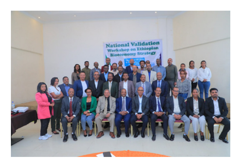
Participants during the bioeconomy strategy validation workshop, December 08, 2023, Addis Ababa.

To meet the above, the national Bioeconomy Strategy has been drafted by putting the above sectors as the main pillars. The Bio and Emerging Technology Institute (BETin) has taken the initiatives and leadership roles. The Government representatives, NGOs, researchers, university professors, private industries, policy advisors and experts from various institutions have been participating since the inception. During document preparation bioeconomy strategies of selected countries around the globe were explored. To validate the draft Bioeconomy Strategy and get inputs for the development of a final robust and more inclusive strategy geared towards propelling Ethiopia to a greener, innovative and sustainable economy, a validation workshop was organized in December 2023 in collaboration with UNIDO. Diverse and relevant stakeholders participated including decision makers, senior officials, researchers, academia, industries and the private sector. From the deliberation, significant inputs were obtained to refine the document and make it ready for implementation after endorsement by Ministry of Innovation and Technology (MinT).