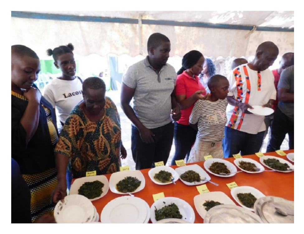
Photo 4: Stakeholders about to taste different traditional leafy vegetables cooked through different methods

An example of such promotion efforts can be found in the AgriFoSe2030 project, 'Governance of food systems for improved food security in Nakuru and Kisumu Counties, Kenya<sup>59</sup>. This project has produced a training manual on production, management, harvesting, preparation, and cooking of traditional leafy vegetables. The project also conducted various tests to assess the effects of different cooking methods on nutritional value of selected traditional leafy vegetables. Cooking demonstrations were also done aimed at building the capacity of actors (especially consumers and cooked food traders) on food handling, food safety, and the best preparation and cooking methods that would reduce loss of nutrients during preparation and cooking. Stakeholders were also given a chance to taste the different traditional leafy vegetables cooked using different cooking methods.