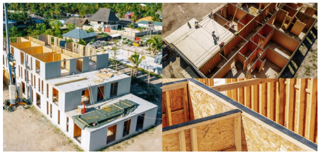
Construction using mass timber in Fumba Town: Photo by CPS

New timber products such as cross-laminated timber (CLT) often called mass timber are thick, compressed layers of wood, creating strong, structural load-bearing elements and are considered the building material of the future. One cubic metre of wood binds half a ton of carbon dioxide, whereas conventional concrete construction is responsible for 25% of CO<sup>2</sup> emissions. The construction industry, responsible for nearly 40% of global carbon emissions, can drastically reduce its footprint by adopting mass timber for a substantial portion of new buildings<sup>79</sup>.