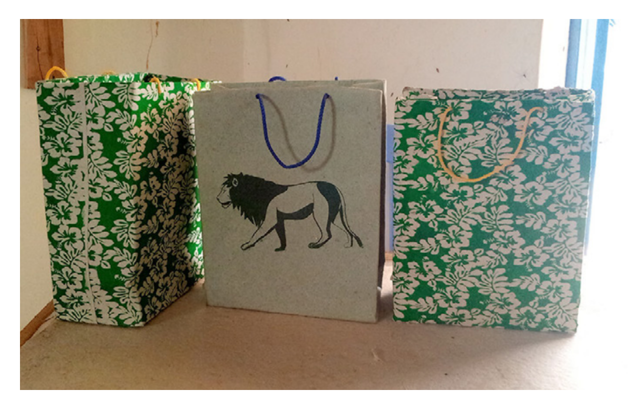
Biodegradable bags from Banana waste

In Kenya, the company Fibertext green paper Ltd buys banana waste from farmers, including stems and extracts fibres from which they make paper and biodegradable packaging material that is cut, folded and branded according to customer demand. In Kenya, banana stems are an underutilized source of fibre and are often left to rot after the banana fruits are harvested. Kenya has approximately 80,000 hectares of banana cultivation with 1200 banana plants per hectare, which translates to about 96 million banana plants<sup>82</sup>. In the post harvesting process, these stems have been used for making manure, livestock feed, and craft items such as mats, The use of banana waste fibres for bio packaging is therefore a new and growing areas of value addition to banana waste.